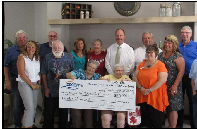
Wendat staff and clients thank SEGBay Chamber of Commerce for donating a portion of the proceeds from their 2017 Golf Tournament.